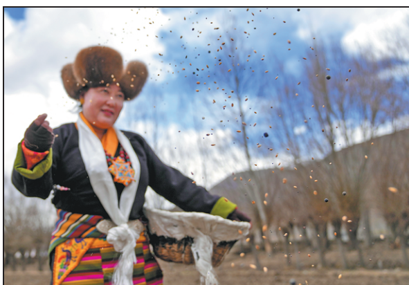
From left: A woman sows seeds on a freshly plowed field during the ceremony. Spring plowing and sowing remain among the most important events of the year for local farmers. The first sowing of the season continues agricultural traditions that date back centuries in the region.